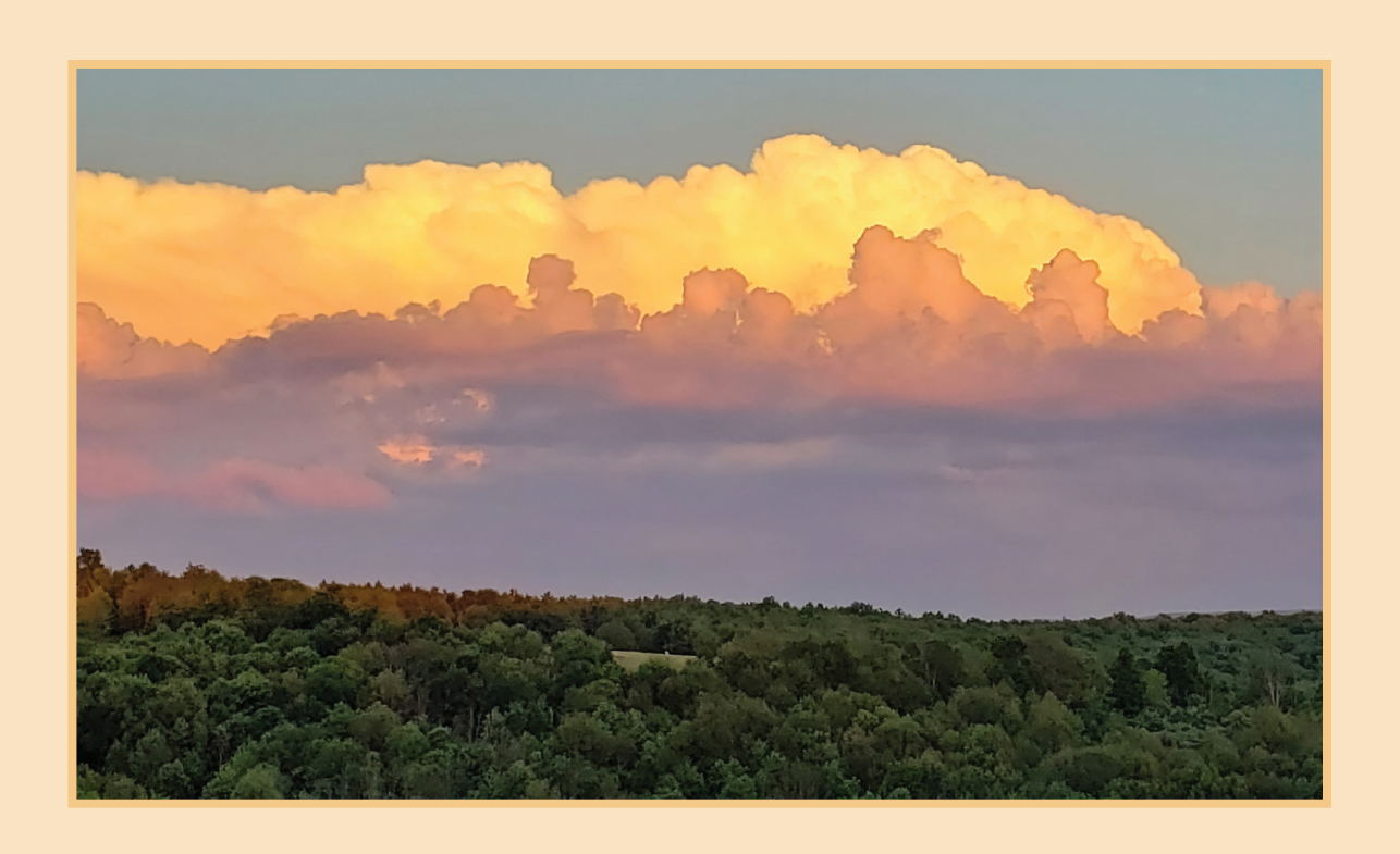
The VISION of Tanglewood Nature Center and Museum is to become a recognized leader in promoting respect and appreciation for our natural environment.